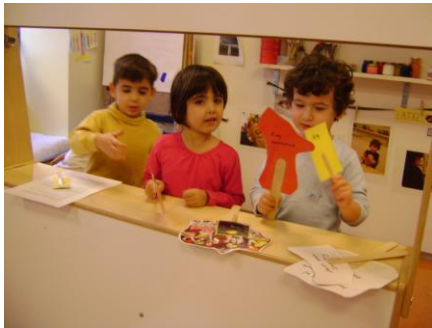
Children acting out stories in the puppet theater.

After looking back on these quotes, we thought about the different strategies children used to overcome their fears. Over the next few weeks we continued to encourage children to share their stories, fears, ideas, and feelings. We read books like: There's Something There by Mercer Mayer, Dreams by Ezra Jack Keats, Only in Dreams: Bedtime Story by Paul Frank Industries. We also had them dictate stories in the writing center that went along with their drawings, and they began to tell stories with the puppets in the puppet theater.