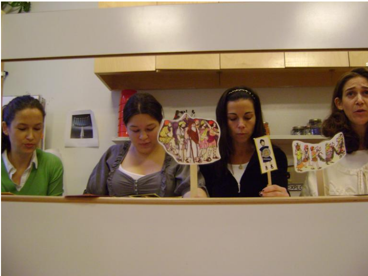
Parents performing the Hanukkah Story puppet show.

Narrator 2: And so, the Jewish people went back to the temple and cleaned up everything. Soon, everything was back to normal, except one thing... They couldn't find any oil to light the Nair Tamid. The looked and looked and finally found a little tiny bit of oil.